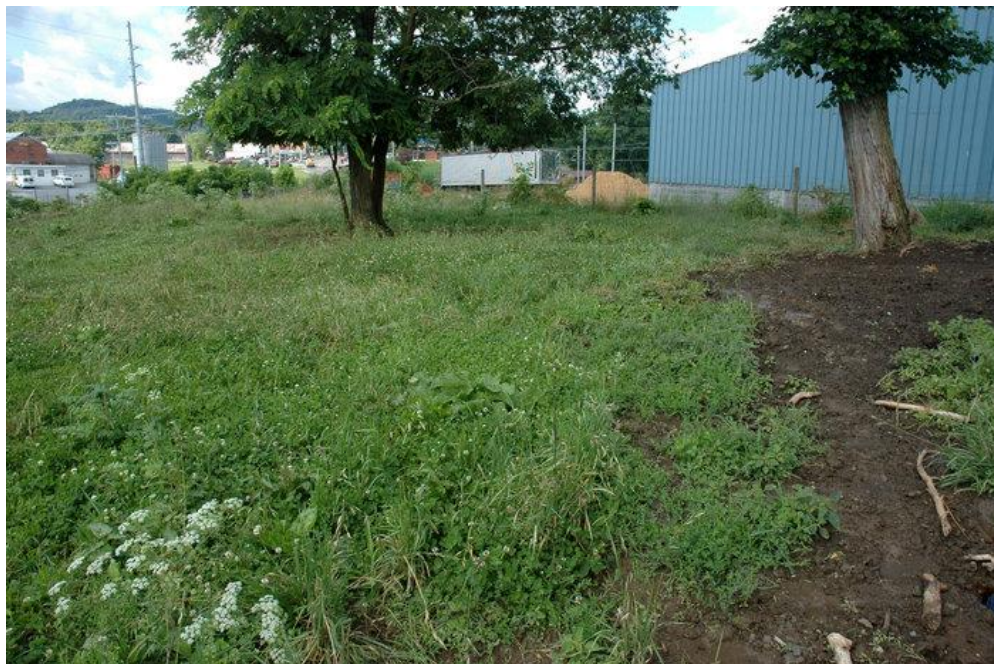
The Little-King Cemetery, located just off East Fairview Avenue in Johnson City.