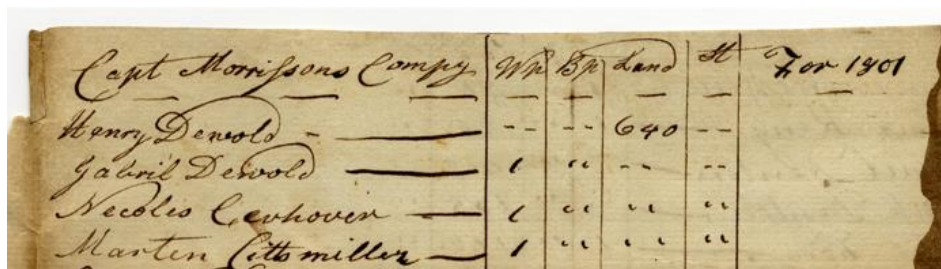
1801 Washington County Tax List, Morrison's Company; original at the Washington County Archives.