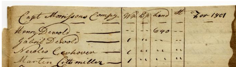
1801 Washington County Tax List, Morrison's Company; original at the Washington County Archives.